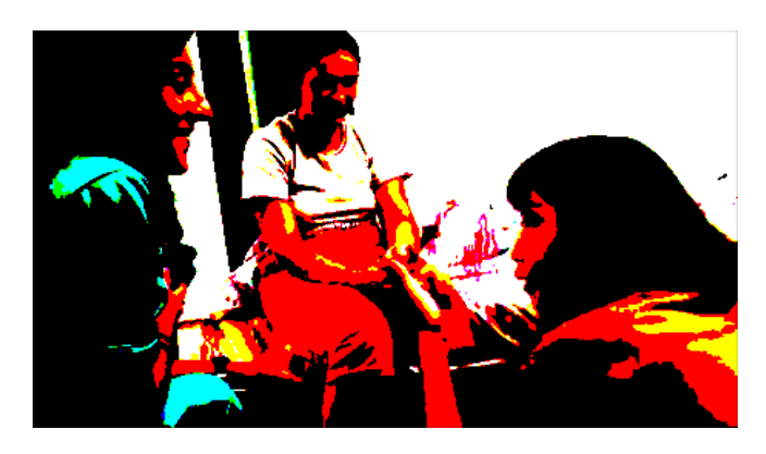
Figure 3. A SNS (social networking service) meeting.

3. Participants' cognition of available semiotic resources to supplement their linguistic limitation can help them to