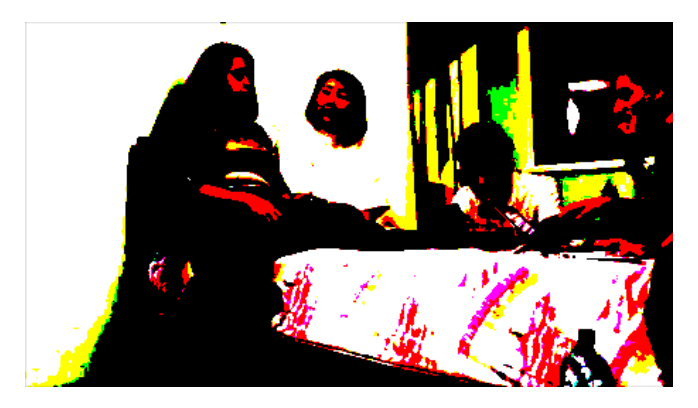
Figure 2. A dorm meeting.