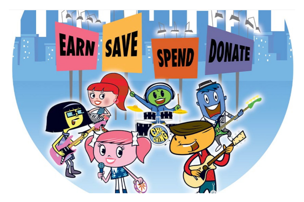
Figure 1. The Cha-Ching band teaches fundamental money management concepts. Adopted from "Cha-Ching financial literacy for children," by Prudential Corporation Asia, 2020. Copyright 2020 by Prudential Corporation Asia. Reprinted with permission.

Before the launch of the program, Prudential conducted